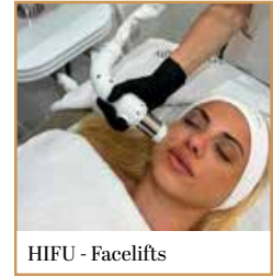
HIFU - Facelifts