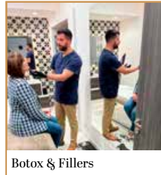
Botox & Fillers